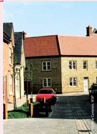
Andrew Cameron, WSP

Connected street networks will generally eliminate the need for drivers to make three-point turns, but sometimes cul-de-sacs may be required to make the best use of land available. If so, turning spaces should relate to their surroundings, not specifically to vehicle movement requirements.