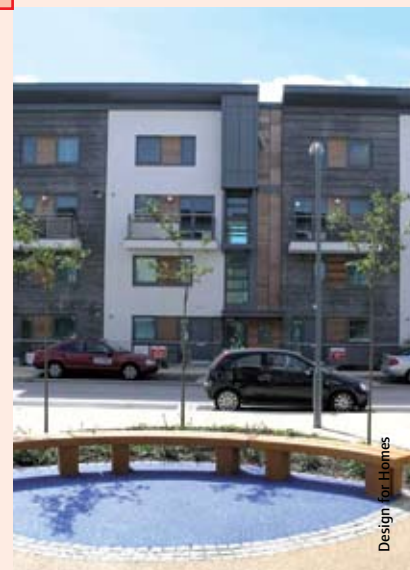
Design for Homes

Parking can be allocated to individual properties (in-curtilage or otherwise), but unallocated parking provides a common resource that helps to ensure space is used efficiently. Footway parking should be avoided.