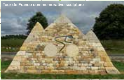
Tour de France commemorative sculpture

In 2013 a new 3 mile walking, cycling and horse riding route from Bilton to Ripley, was completed thanks largely to the re-opening of the 1848 railway viaduct over the Nidd Gorge. The whole project was a joint effort by Harrogate Borough Council, North Yorkshire County Council, local cycling groups and Sustrans, supported by The National Lottery. A little later the greenway was extended beyond Ripley along Hollybank Lane towards Clint.